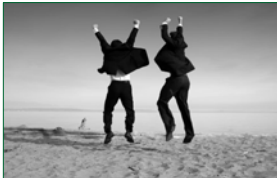
Members Getting Great Deals on a Daily Basis

We are always moving forward with you in mind!!